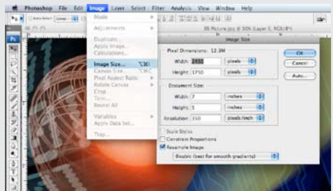
Image resolution is actually the measure of pixels (across and down) that make up your image. In the sample below, the image size window shows that the image width is 2450 px. while the height is 1750 px. The dpi (dots per inch) is only important when considering the final viewing size. Offset lithography printing (brochure printing) requires a dpi of at least 300 at the size the image will be printed. Your submissions should have a safe resolution as long as the smallest pixel dimension is 1600 or greater. This resolution allows viewers the ability to zoom in for viewing details.

The above image shows the "Image Size" window where you can check your image's resolution. The most important numbers to look at are the "Pixel Dimensions."